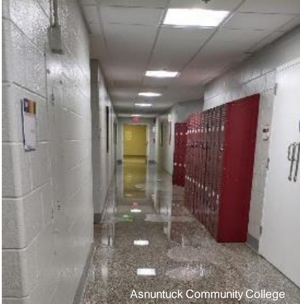
Asnuntuck Community College