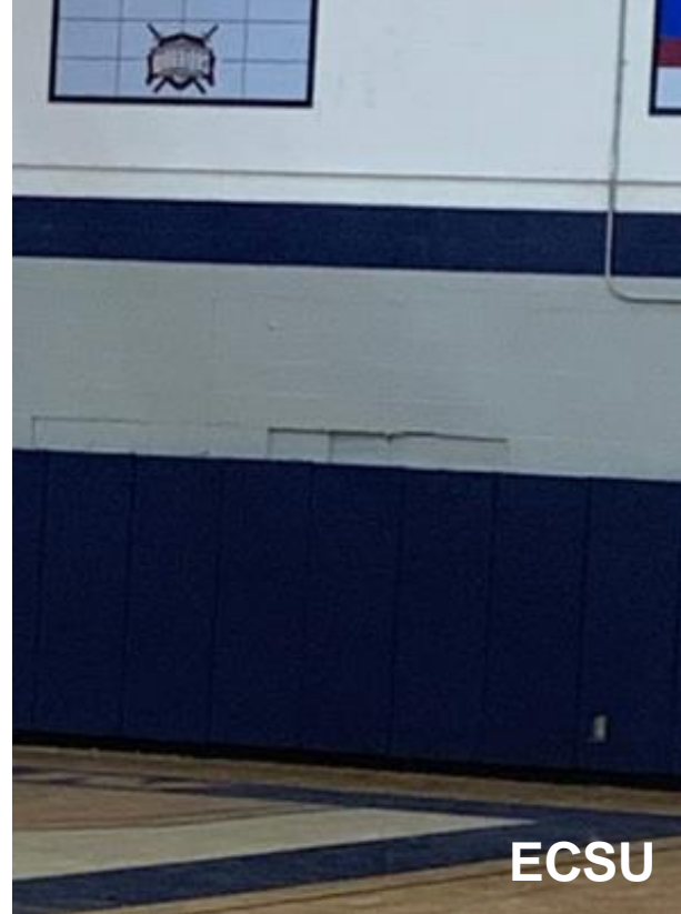
STRUCTURAL WALL DETERIORATION