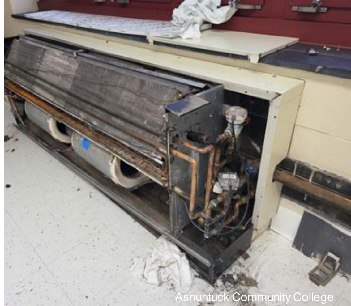
Asnuntuck Community College

MULTIPLE FIRE DEPARTMENT EMERGENCY RESPONSES