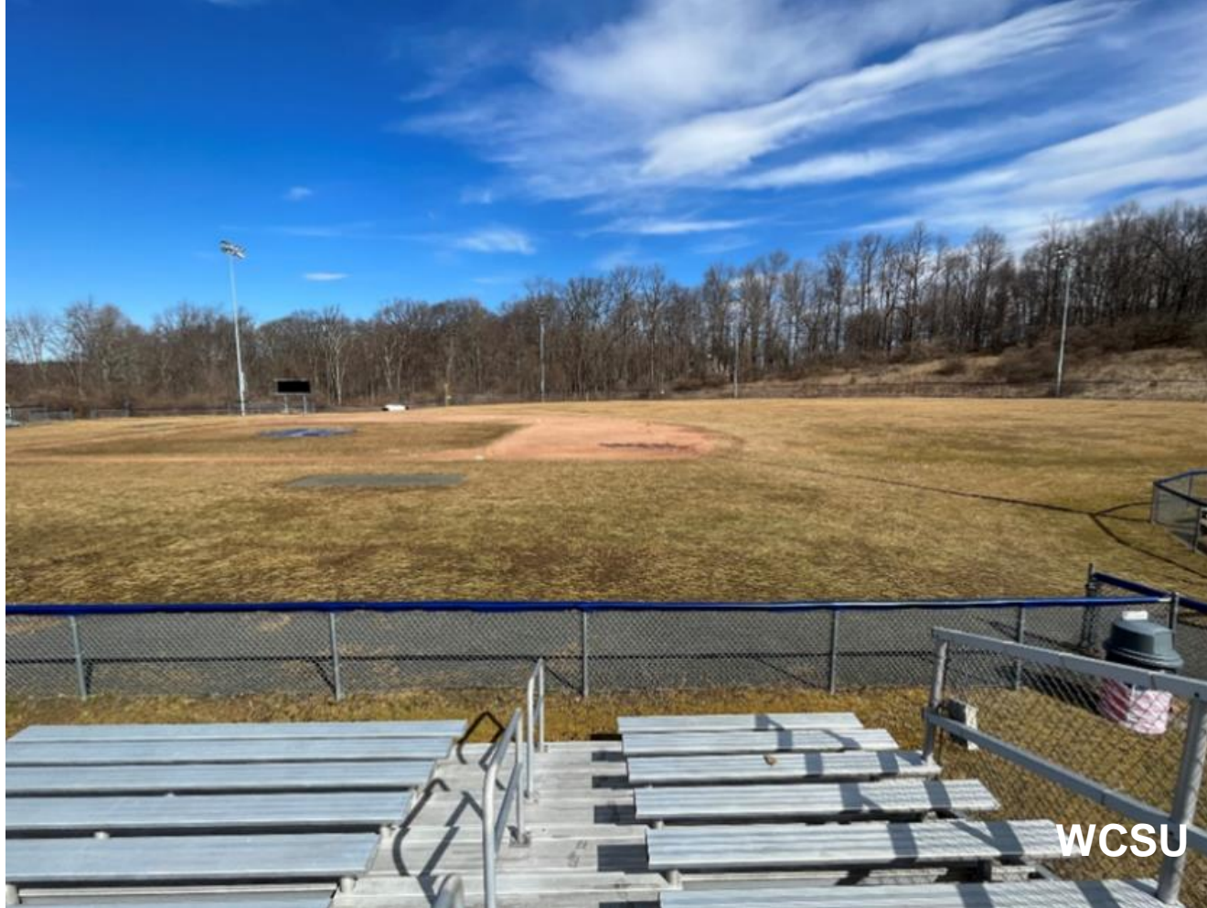
VISIBLE 3' GRADE DROP ACROSS THE BASEBALL FIELD