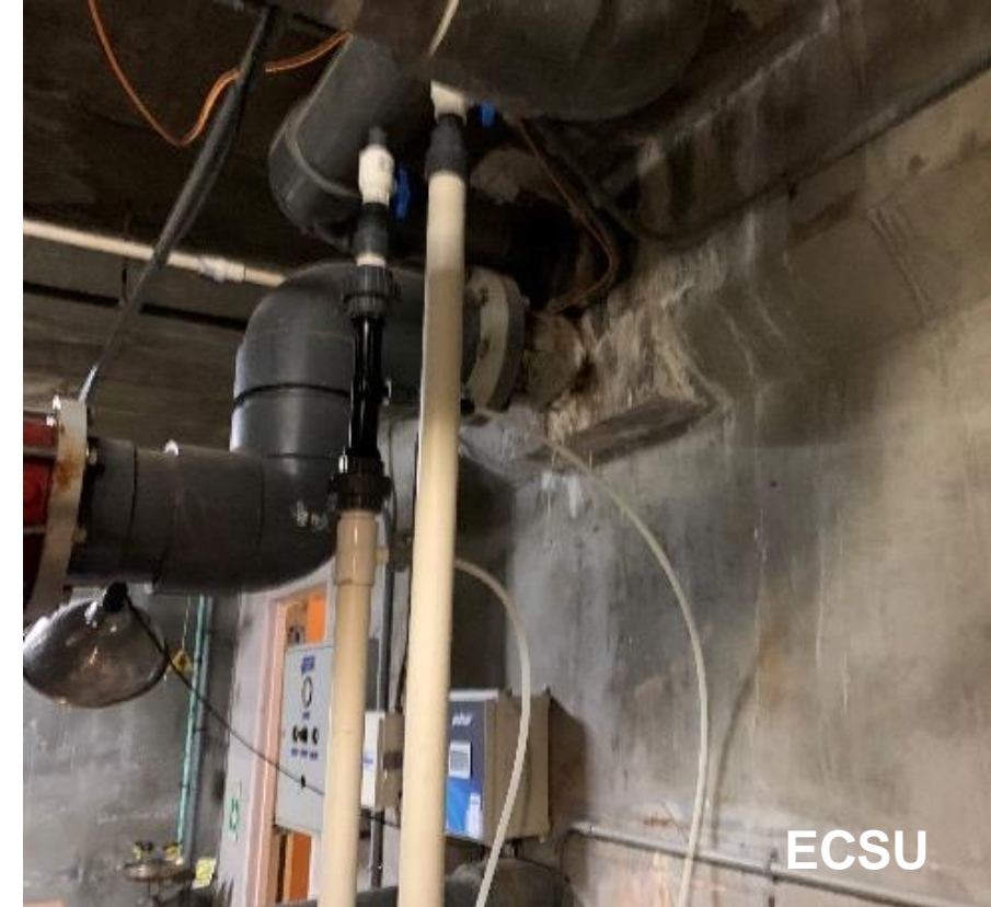
END OF LIFE POOL EQUIPMENT