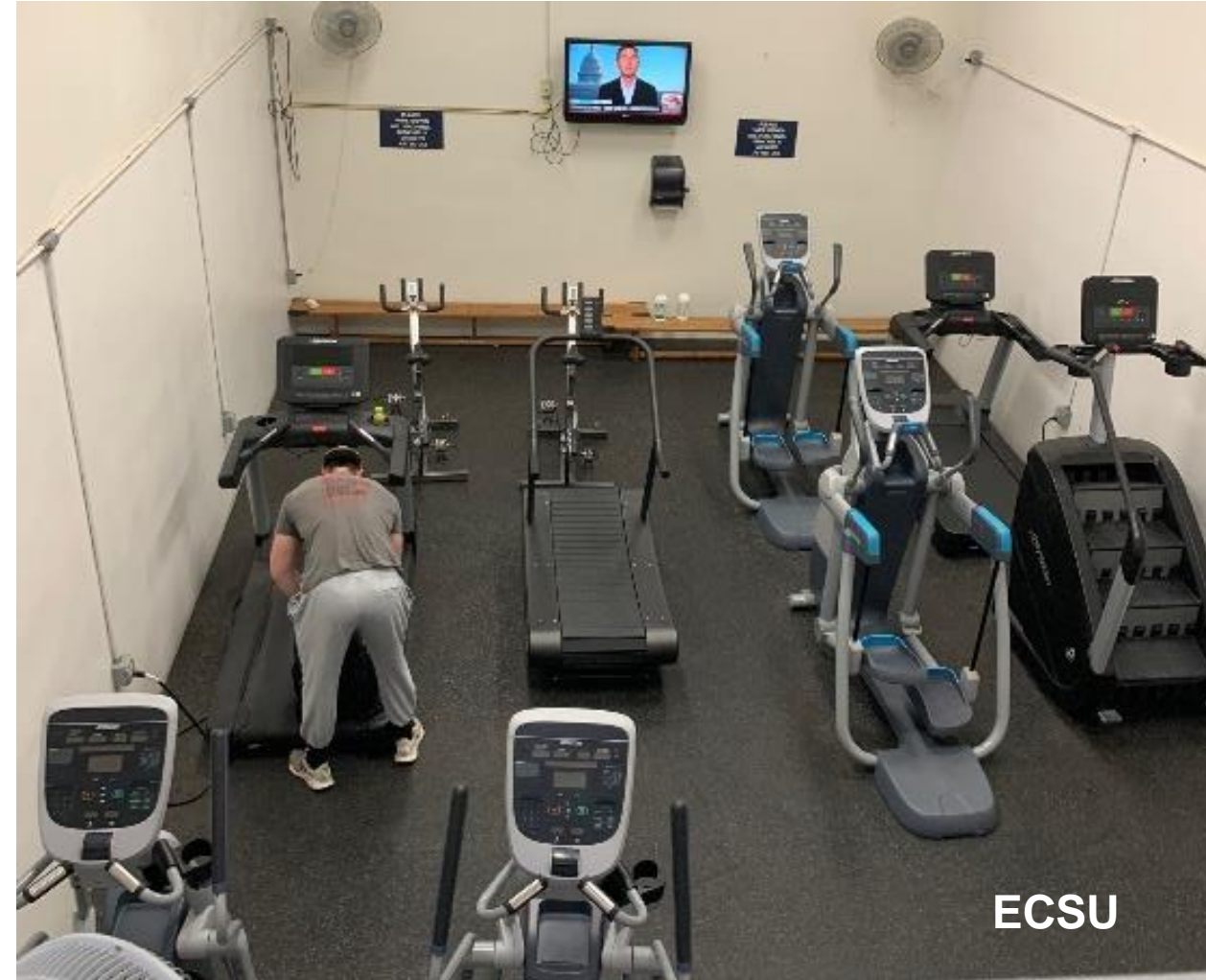
INADEQUATE UNIVERSITY PROGRAM SPACE