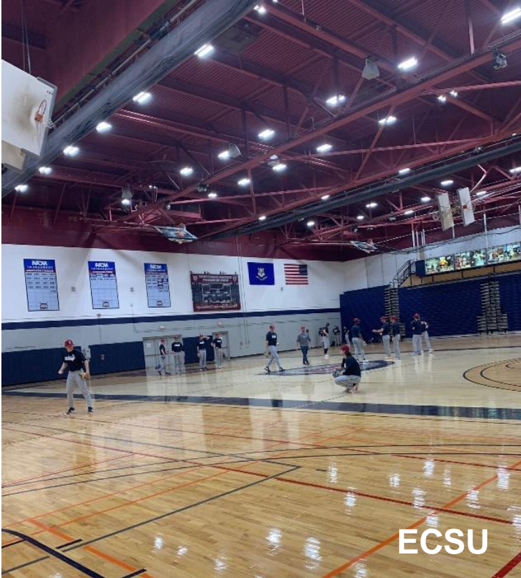
WELL MAINTAINED BUT MERCURY CONTAINING SUBFLOOR UNDER GYM FLOOR