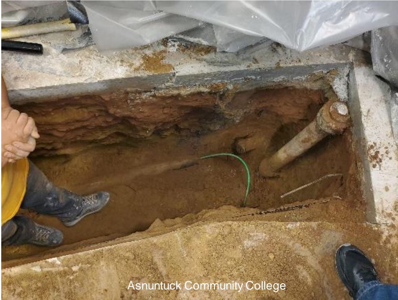
SEPARATED SEWER LINE UNDER CLASSROOM