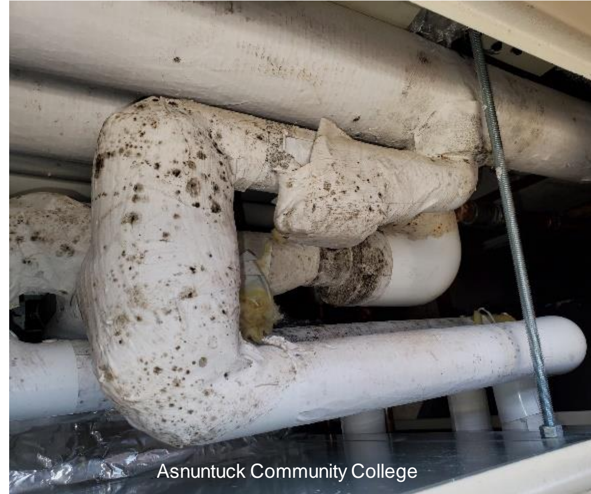
MOLD AND MILDEW