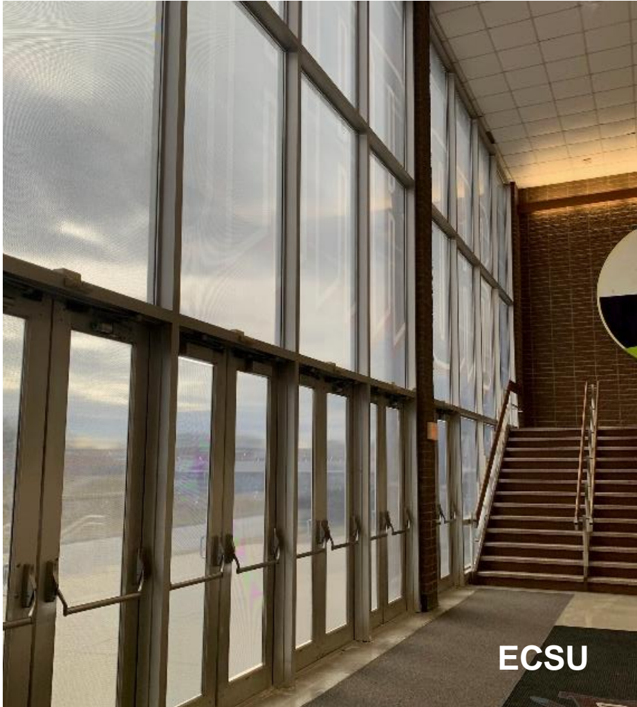
1977 FAILING GLASS CURTAIN WALL