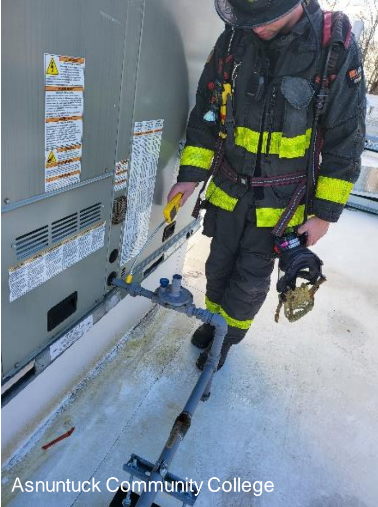
Asnuntuck Community College

MULTIPLE FIRE DEPARTMENT EMERGENCY RESPONSES