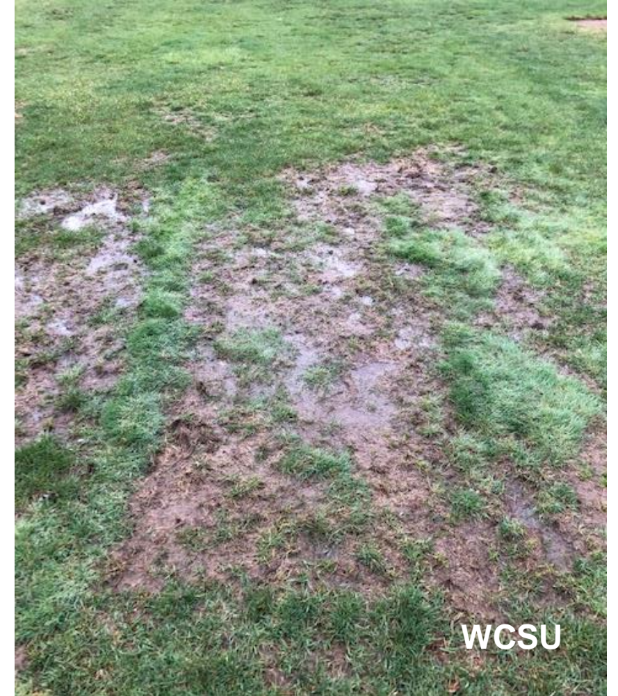
COMMON BASEBALL AND SOFTBALL FIELD DRAINAGE ISSUES THAT CAUSE DIFFICULT RESTORATION